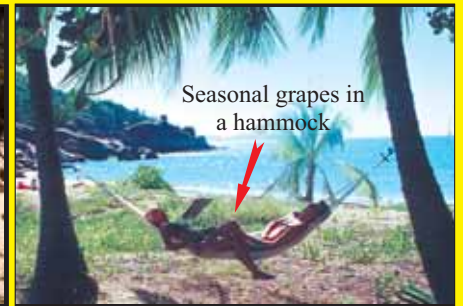
Seasonal grapes in a hammock