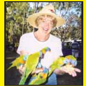
Interact with Island nature. Take great photos