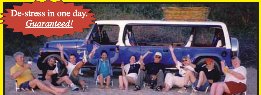
Be in the right place at the right time. Fun, Fun, Fun and more Fun!