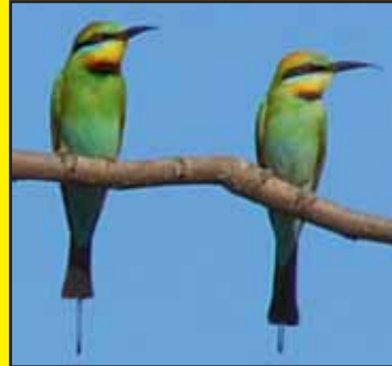
Rainbow Bee Eaters